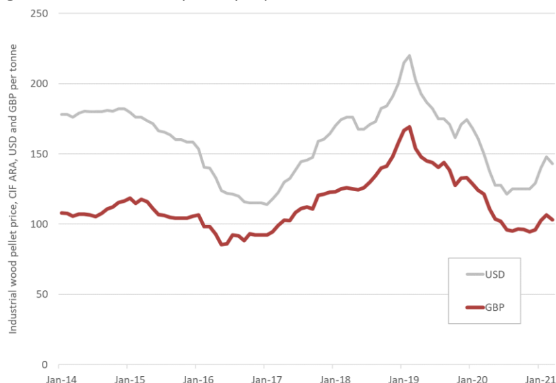
Figure 1: Industrial wood pellet spot prices in GBP & USD, 2014-2021

Note: Market benchmark prices are quoted in USD on a CIF ARA (Amsterdam, Rotterdam, Antwerp) basis. Prices have been converted into GBP at monthly average exchange rates.