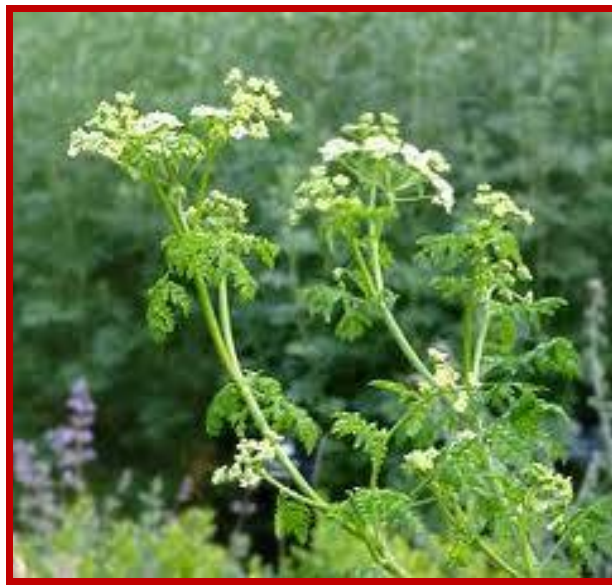
Yew – Taxus baccata